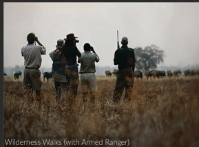
Wilderness Walks (with Armed Ranger)