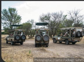
Photographic | Game Package Safaris