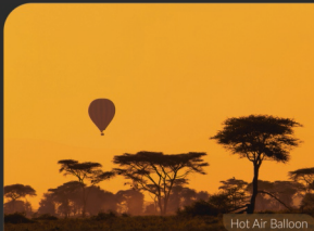
Hot Air Balloon