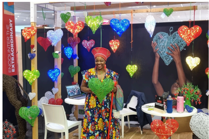
Mama Africa – Hot Water