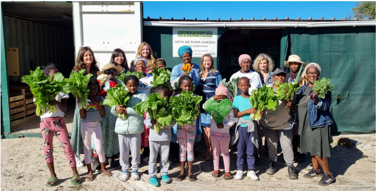
Visiting the Moya We Khaya “Spirit of Home” Urban micro farm in Khayelitsha