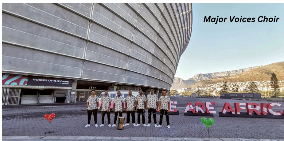
Major Voices Choir