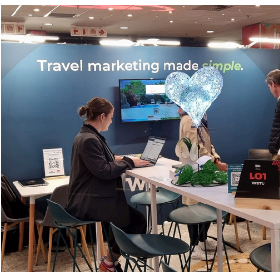
The WETU stand decorated with hearts.

Thank you to We Are Africa and The Tribe for the continued love and support.