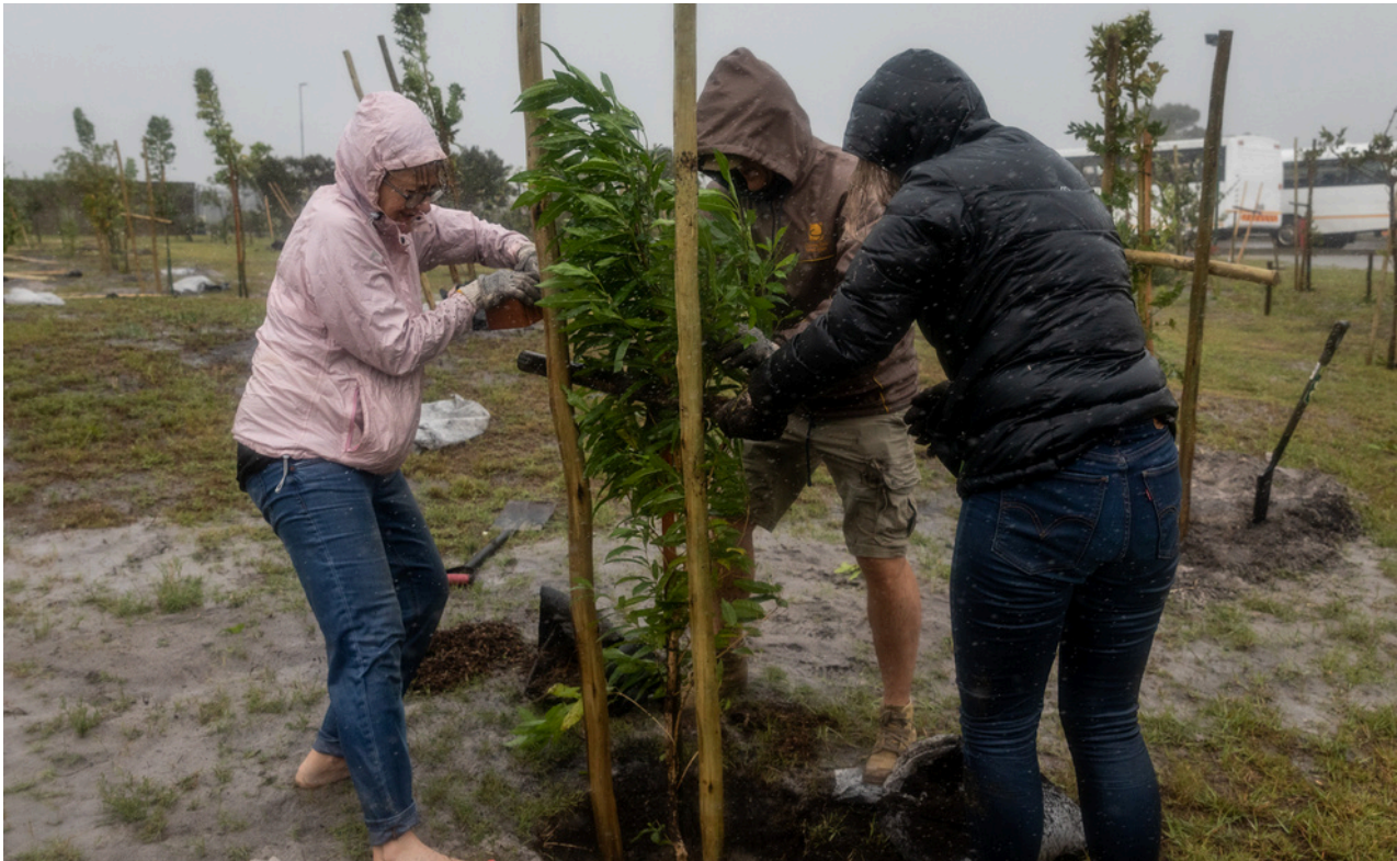
The 2024 tree planting took place in the midst of the “Cape of Storms”

The We Are Africa Tree-athlon aims to maximise the positive impact of the annual gathering in Cape Town and contribute to a more sustainable future and benefit many future generations to come.”